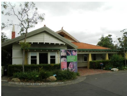
Backyard to Bush House (map ref. E4)